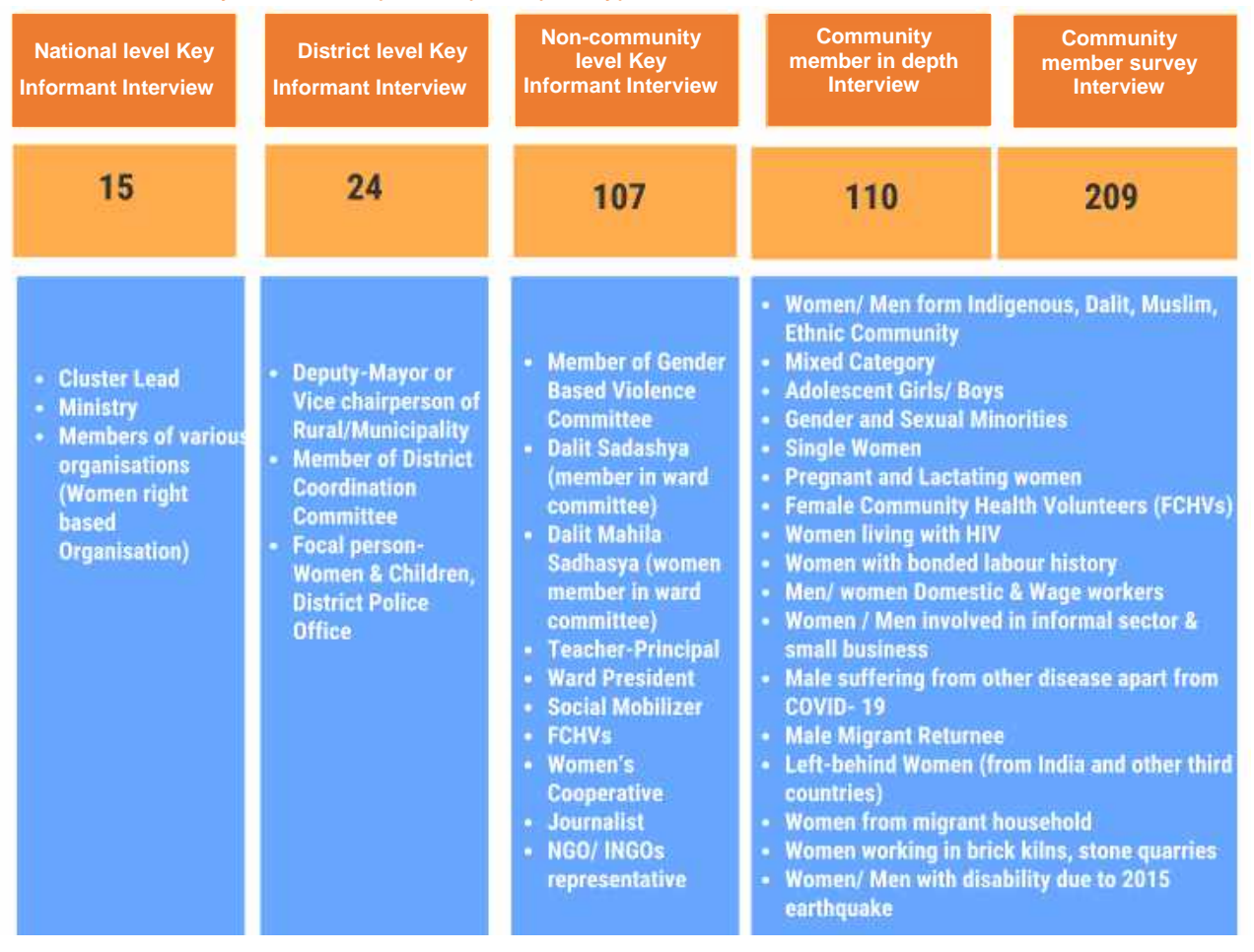
Table 1: Study tool and respective participant type

All the interviews were conducted by phone, as travelling to the districts was not possible owing to the lockdown imposed by the government to contain the spread of COVID-19. Details of each respondent are divided by category, ethnicity and gender (Annex-3, Table 2).