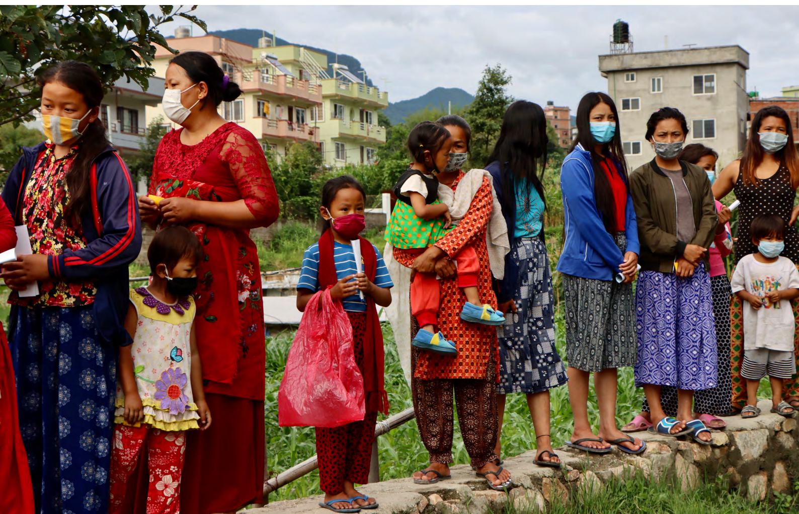
Women, girls and children standing in a queue to collect relief materials.

At a time when increased social isolation and restrictions on women and girl's movements in many parts of Nepal is resulting in the entrenchment of negative gender norms, coupled with reduced access to support services and the reallocation of funds away from gender equality and women's empowerment (GEWE), there is a critical need to look closely at how these factors are changing the dynamics around harmful practices across the country.