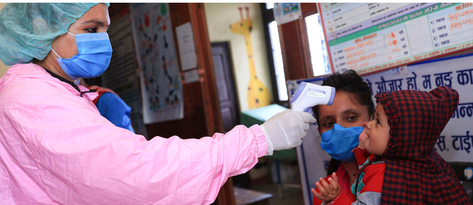
A health worker checks body temperature of patients at Jeetpurphedi Health Post.

Evidence from multiple settings, including India and Bangladesh, shows that child marriages and dowry practices often increase during crises as many families turn to these as a negative coping mechanisms to deal with greater economic hardship and to protect girls from violence outside the home and avoid the shame of their daughters engaging in pre-marital relationships or becoming pregnant outside marriage. 13,14 In Bangladesh, there is evidence that many families marry their girls at young ages to mitigate the loss of land and shelter due to floods and natural disasters. 15 Meanwhile, in India, a children's helpline reported a 17% increase in distress calls related to early marriage of girls in June and July compared to the same period a year earlier. 16 Less is known about the impact of pandemics on other harmful practices that are prevalent in Nepal.