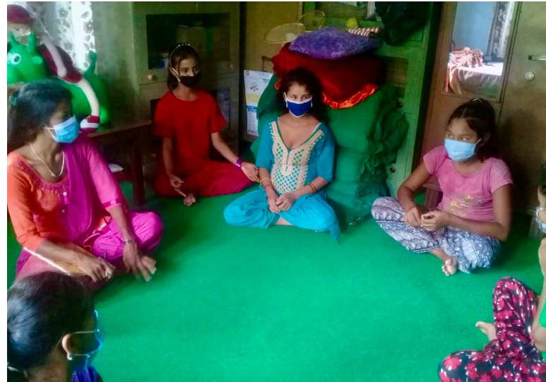
Group counseling sessions were organized by UN Women's partner, Women's Rehabilitation Centre (WOREC) in a quarantine site in Kailali, Province 7.

In order to develop strategies to reduce a specific harmful practice, it is important to undertake analysis to determine which of these risk factors are most prevalent in a given setting and how to address these alongside gender and power inequalities. It is also important to be aware that in contexts where multiple harmful practices coincide, such as child marriage and bride price/dowry, negative outcomes can be compounded. For example, in Nepal dowry has been linked to perpetuating the practice of child marriage, as younger girls require lower dowries. 5 Child marriage then has devastating consequences for girls such as increased risks of intimate partner violence (IPV), correlation with teenage pregnancies, higher rates of maternal and child mortality, poverty, and negative educational outcomes for both mother and child. 6