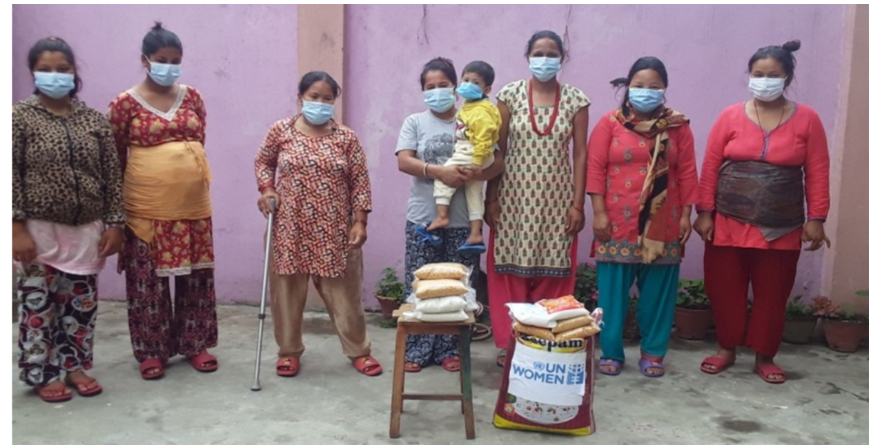
Relief distribution of food items to survivors of domestic violence residing in Saathi's shelter home.

Strengthen private sector engagement to ensure an adequate number of hospital beds available for COVID-19 patients, especially those with moderate and severe cases.